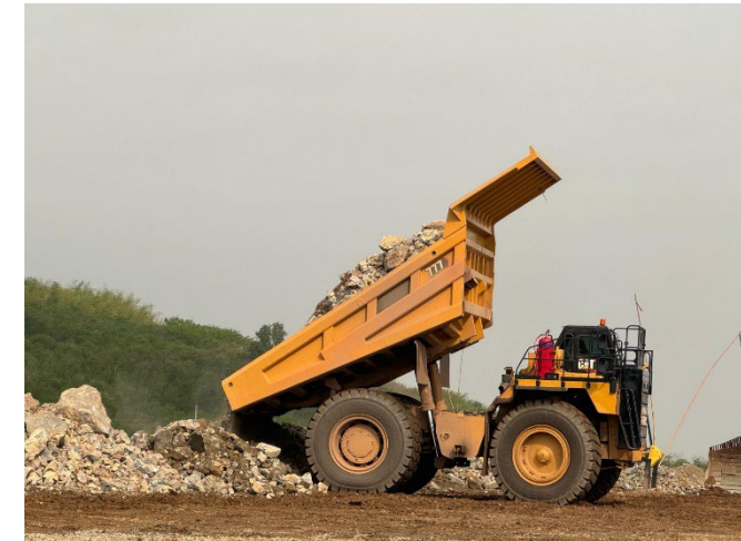
First truck load of fresh ore