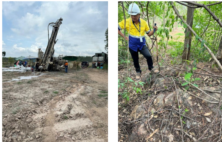
RC drilling and rock chip sampling (May 2024)