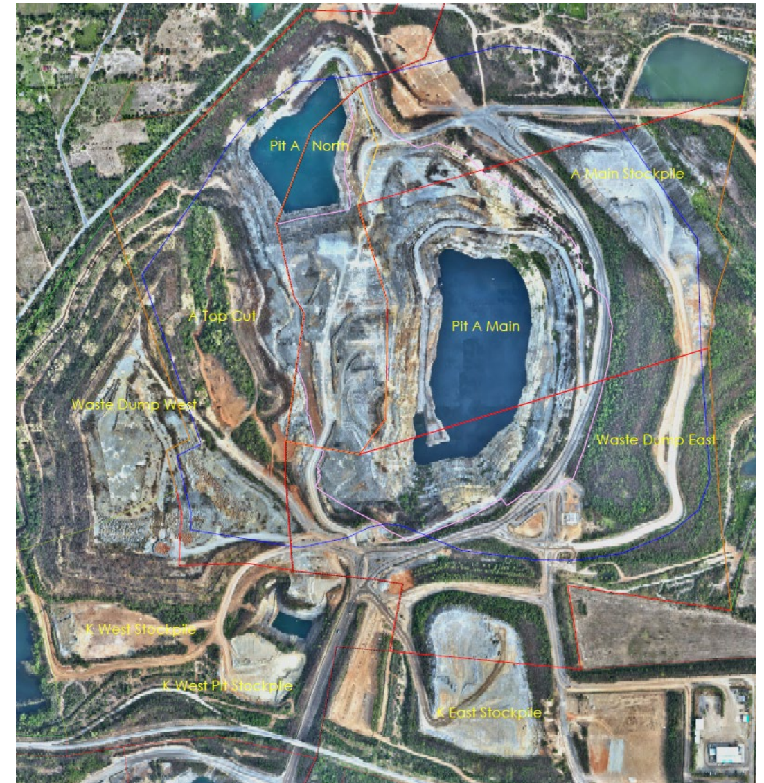
Schematic of Chatree Gold Mine