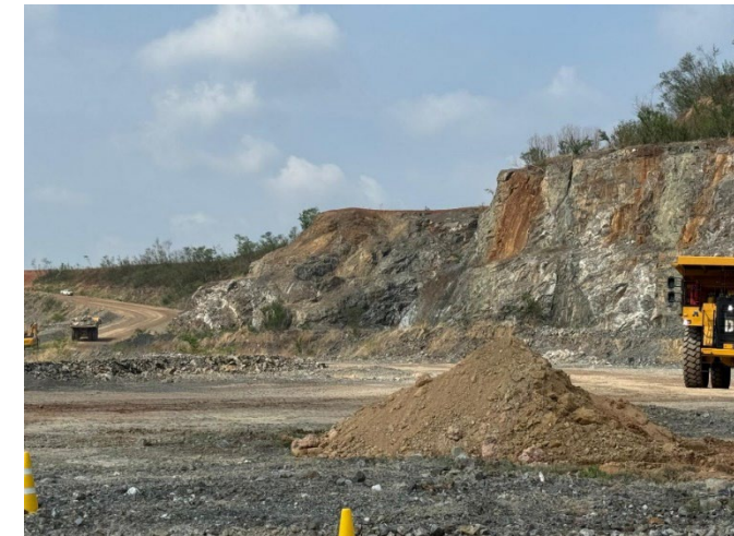
Visible quartz veining, A pit